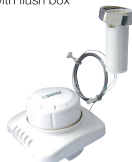
HERZ-Thermostat with remote adjustment